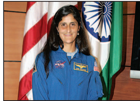
Sunita Williams, Astronaut