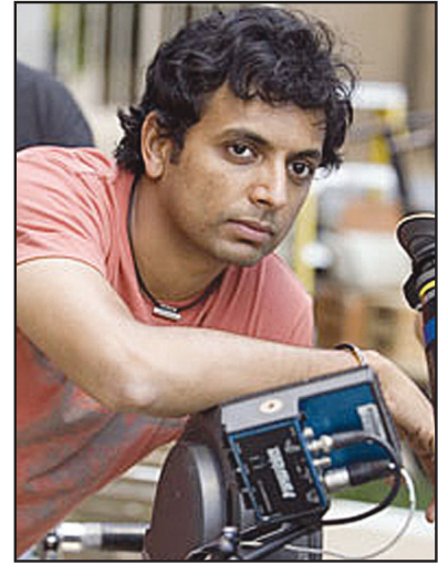
Manoj Night Shyamalan Director