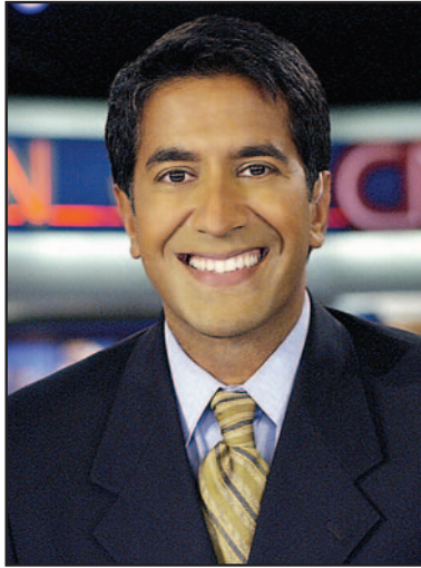
Dr. Sanjay Gupta Chief Medical Correspondent, CNN