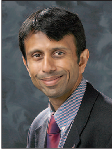
Bobby Jindal Governor of Louisiana